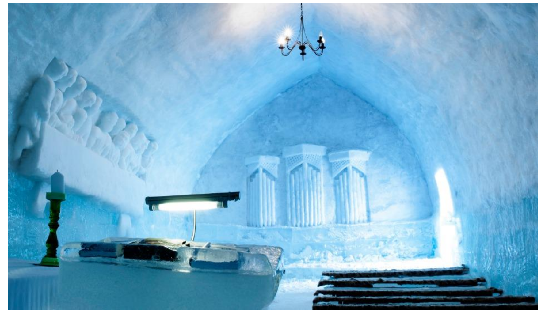
Ice Hotel, Sweden