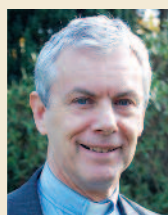
Leeds The Venerable Paul Hooper