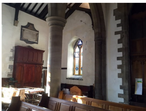
SW corner prior to works