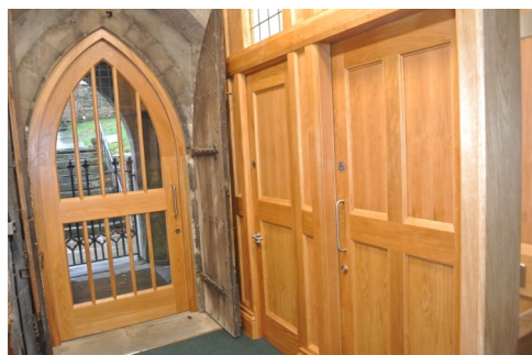
Draught lobby, entrance and toilets