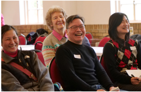
Sunday worship service.

New arrivals from Hong Kong continue to be supported and welcomed by St Barnabas' Church in Alwoodley.