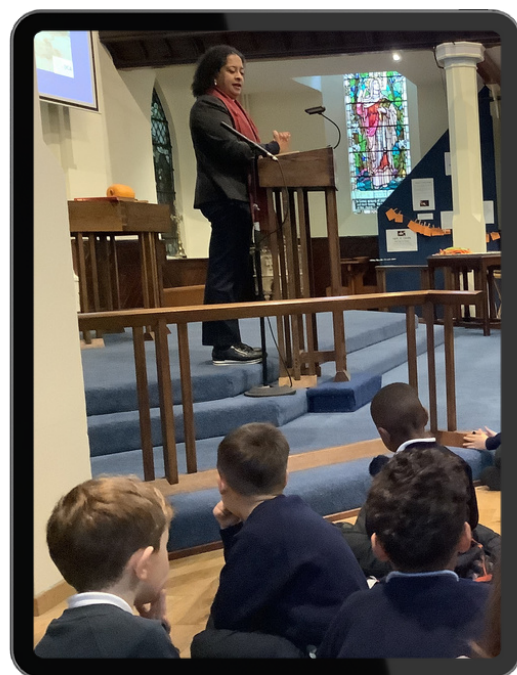
Harvest Service, St John's CE (VA) J & I School, Golcar