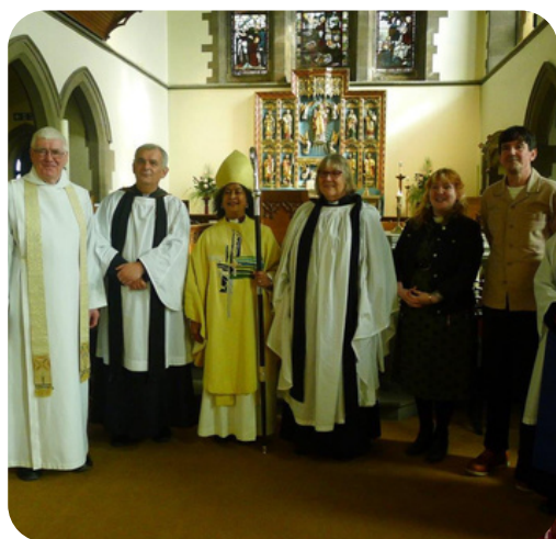
190th Anniversary of the Parish Church of Hebden Bridge