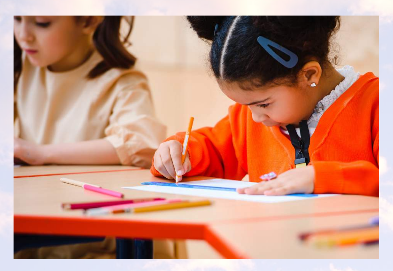
Come back and see us and tell us all about what you discover and learn at school!